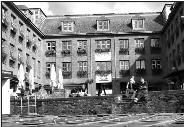
Honorable Mention, Brooke Cosby Oxford, England